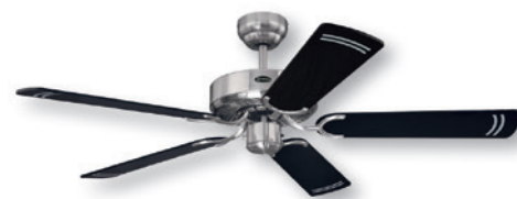
black/ black with silver stripes

Electricity consumption/year: ..... 19,9 kWh RPM: ..... 180/130/80 Wattage: ..... 58/40/26 Noise level: ..... 49,70dB(A) Motor size: ..... AC Motor 153 x 15 mm Maximum fan flow rate: ..... 152,37 m 3 /min Blade pitch: ..... 12° Max. ceiling pitch: ..... 13°